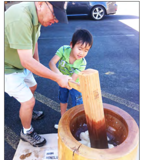
Pounding mochi is fun for the whole family!

top-to-bottom oosouji , or year-end temple cleaning, starting at 9 am, and our twice-a-year Ehime Maru Memorial community service cleaning at Kakaako Waterfront Park on Saturday, Dec. 27. We'll meet at the park at 12 noon, and after cleaning, we'll enjoy a relaxing picnic lunch.