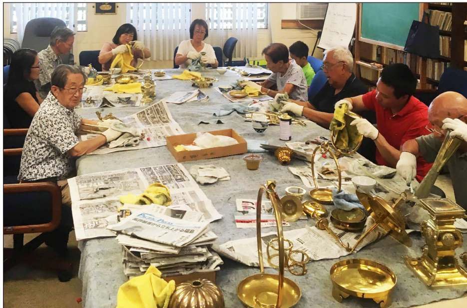
OMIGAKI: Volunteers gather around the conference room table, don gloves and grab a polishing cloth to make sure the altar implements look their Sunday best in preparation for the New Year. It's also a great way to keep up with the goings-on in the community!