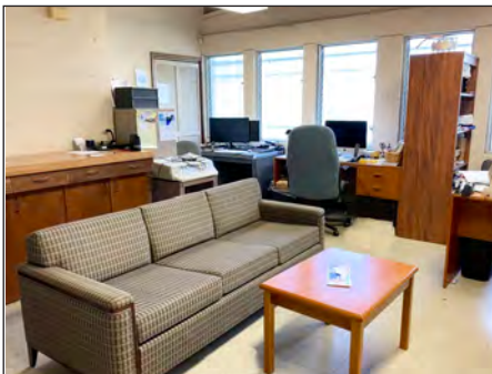
Office makeover: Kupuna Aikido and member volunteers conducted some major KonMari-style clearing of fixtures and items no longer needed in the Betsuin office, and a donated sofa adds a welcoming touch.

If you're celebrating your 80th birthday next year, please let us know. We'll nominate you for an invitation to the luncheon in September 2020.