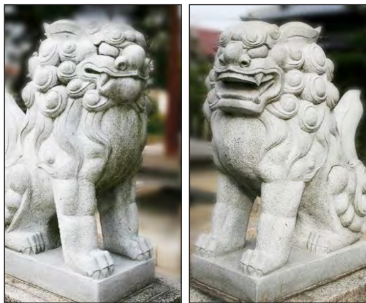
This pair of komainu lion-dogs guard a shrine.

Together these statues represent the beginning and the ending, initially described by the sacred Sanskrit word "a-hūm" and incorporated into images of open- and closed-mouth Indian deities at temple entrances.