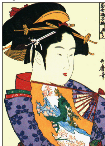
Ukiyo-e by Utamaro (1753-1806), popular in his day for his "bijinga" prints of beautiful women.

For example, in the Edo period, the image of a beautiful woman was the same as that seen in ukiyo-e prints: narrow eyes, a small nose, a small mouth, and an outline of a face called an urizanegao (literally, a gourd-shaped face). Boys were favored for their long faces, narrow eyes, and straight-line mouth, just as the preferred look for Kabuki actors was a beautiful boyish face. This is quite different from today's sense of physical attractiveness. Nowadays, it seems that the beauty ideal of both sexes is large eyes, high noses, moderately large mouths and tall. The human sense of beauty value changes with time.