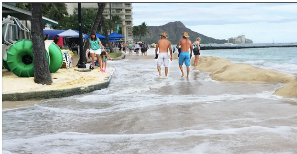
Waves breach makeshift sand barriers at Ft. Derussy in this Hawaii and Pacific Islands King Tides Project photo from 2017. It provides a stark preview of how global warming and sea level rise will affect low-lying areas such as this section of Waikiki Beach in the years to come.

もし、ワイキキビーチがなくなったら、私たちはどうするのでしょうか？気候変動による海面上昇で南カリフォルニアなどが水没したら、私たちはどこに住めば良いのでしょうか。海水温の上昇に伴う熱波や気象災害をどう乗り越え、生きてゆけばよいのでしょうか。