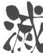
滅 The Extinction of Suffering

If desire, which lies at the root of all human passion, can be removed, then passion will die out and all human suffering will be ended. This is called the Truth of the Cessation of Suffering .