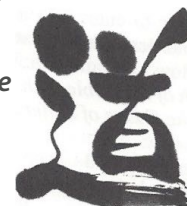
道 The Path to Nirvana

People should keep these Four Noble Truths clearly in mind.