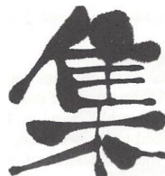
集 The Cause of Suffering

The cause of human suffering is undoubtedly found in the thirsts of the physical body and in the illusions of worldly passion. If these thirsts and illusions are traced to their source, they are found to be rooted in the intense desires of physical instincts. Thus, desire, having a strong will to live as its basis, seeks