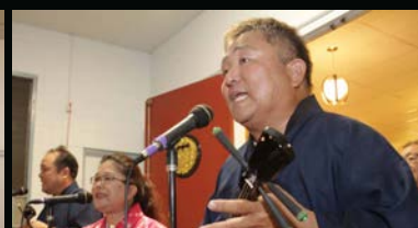
Hawaii Eisa Shinyuu Kai musicians