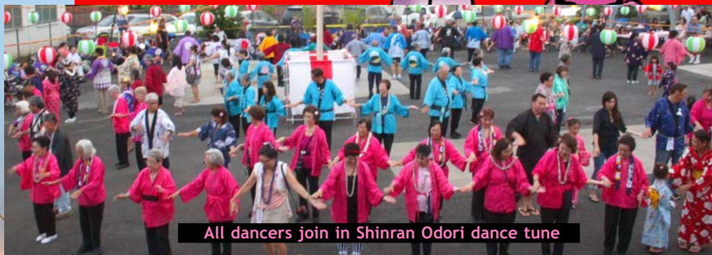
All dancers join in Shinran Odori dance tune