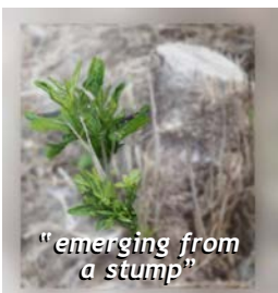
"emerging from a stump"

Once there was a king who had four sons. They were very inquisitive and they constantly asked questions of everyone. One day, they heard about a senna tree, so they went to the chief gardener and asked the gardener to show it to them.