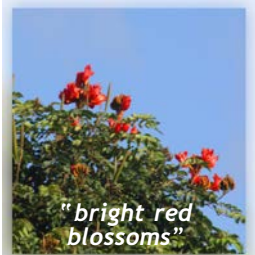
"bright red blossoms"