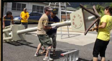
OK, ready? Get it! Get it! Hai! Got it! Got it!