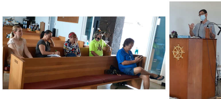
Members Sunday Service . Sunday, 16 & 23, 2023.