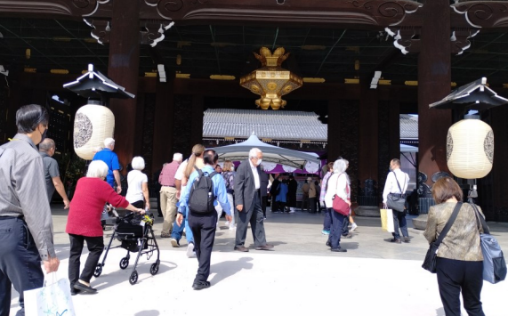
Hawaii Members Honzan Japan Tour, April 17 to 25 2023